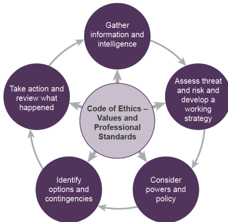
Figure 1: National Decision Model for policing